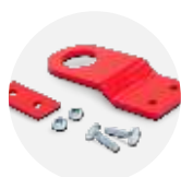
Crane lifting eyes CLEK