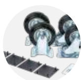
Castor kit CAS160-KS-FX-SB-CP