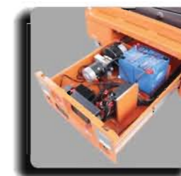
Slide Out Tray