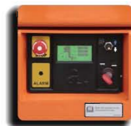
Touch Display Screen