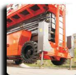
Automatic Leveling Outriggers