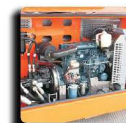
Swing-out Engine Tray