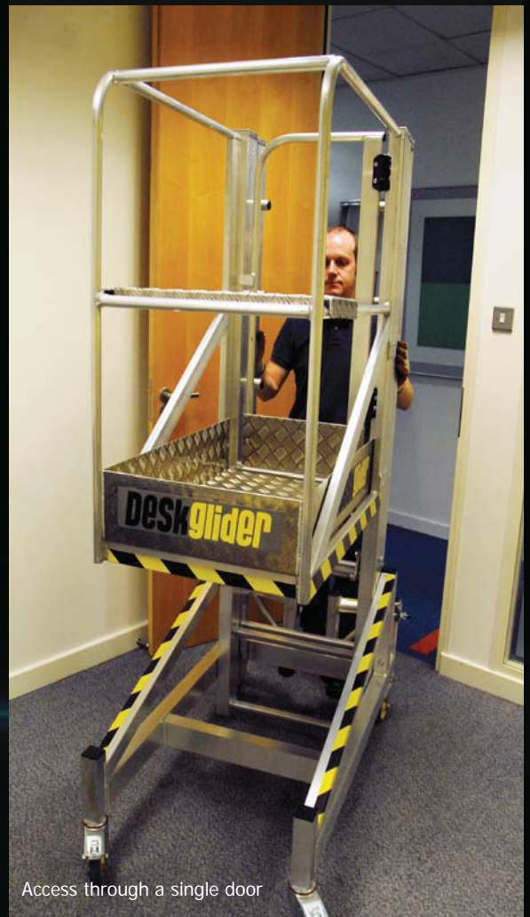
Access through a single door

Once in position, the Deskglider could not be simpler to use and to adjust to the required height.